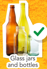
Glass jars and bottles