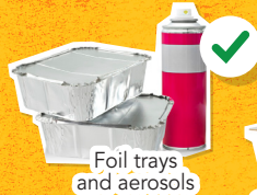
Foil trays and aerosols