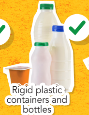
Rigid plastic containers and bottles