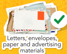
Letters, envelopes, paper and advertising materials