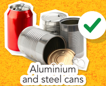
Aluminium and steel cans