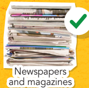
Newspapers and magazines