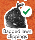
Bagged lawn clippings